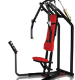
A350 Biaxial Chest Press