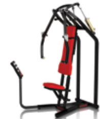
A350 Biaxial Chest Press