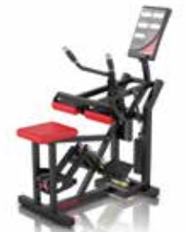
A300 Seated Calf