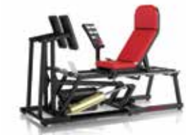
A300 Leg Press