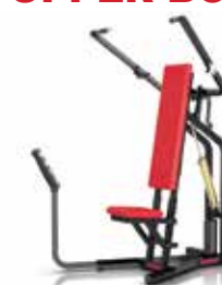
A250 Lat Pulldown