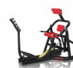
A250 Lower Back