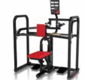
A350 Biaxial Upper Back