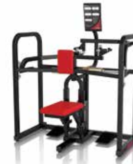
Biaxial Upper Back