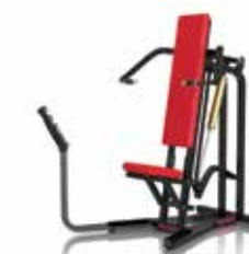
A250 Military Press