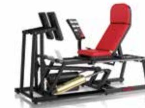
A300 Leg Press