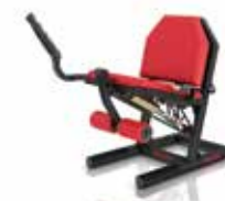
A300 Leg Extension Pro