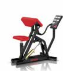
A250 Arm Curl