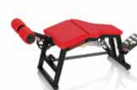
A300 Leg Curl Pro