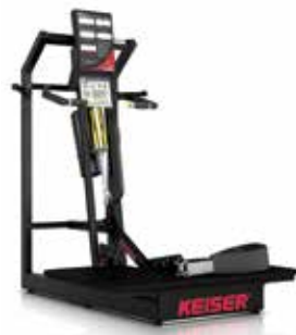
A300 Belt Squat