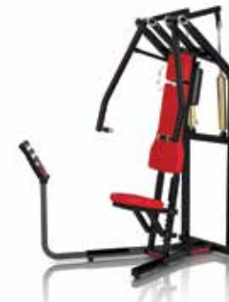
Chest Press Pro